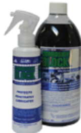
32 oz. Bulk