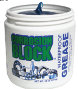
16 oz. Tub

Also available in: 2oz. Tube • 3 & 14 oz. Cartridge