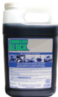
4 L Bulk